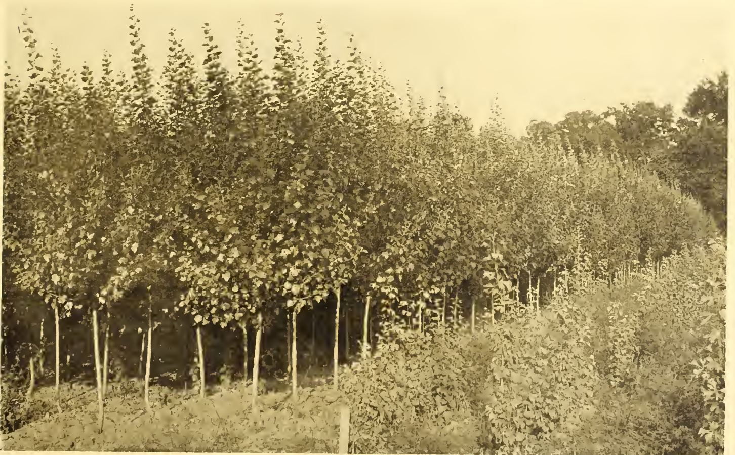
Our White Poplars